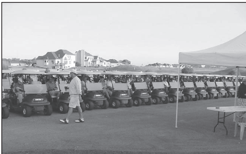
Golfers listen to instructions from Golf Course Management before a great day of golf.